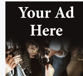
300x250 – Square