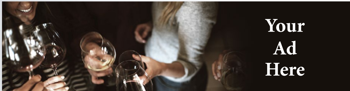
970x250 – Leaderboard