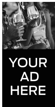
Large Rectangle - Vertical 300x 600