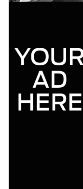
Portrait 300x1050 can be divided into multiple content sections`

Banner ad prices are listed as FLAT RATE. WineMag.com refers to the Interactive Advertising Bureau for standard ad sizes and file size limits. We support most rich media vendors including, Atlas, Eyeblaster, Eyewonder, PointRoll, Unicast/Viewpoint.